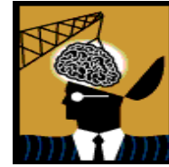
Electronic Brain Solutions